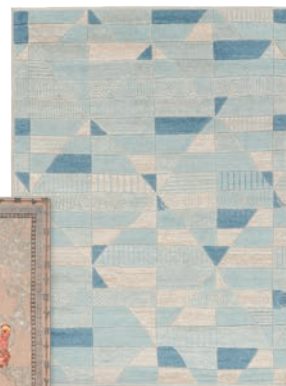
↑ Scandinavian High rug, Rug & Kilim.