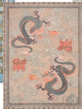
↓ Cadmus rug, New Moon Rugs.