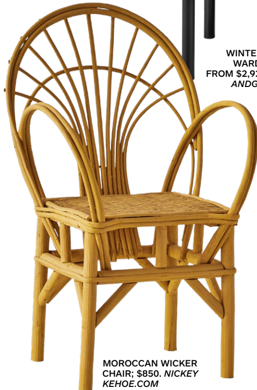
MOROCCAN WICKER CHAIR; $850. NICKEY KEHOE.COM