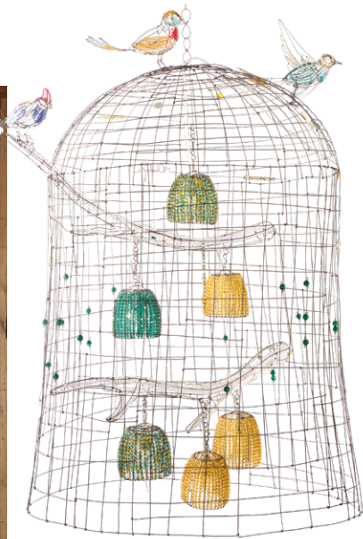
CASE OISEAUX CHANDELIER BY MARIE CHRISTOPHE; PRICE UPON REQUEST. LISAFONTANAROSA.COM