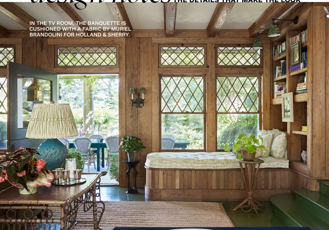
IN THE TV ROOM, THE BANQUETTE IS CUSHIONED WITH A FABRIC BY MURIEL BRANDOLINI FOR HOLLAND & SHERRY.