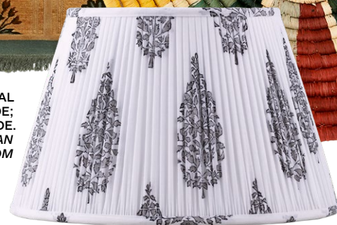
CHLOE TRIBAL LAMPSHADE; TO THE TRADE. VAUGHAN DESIGNS.COM