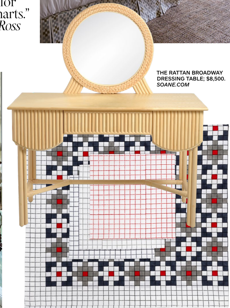
THE RATTAN BROADWAY DRESSING TABLE; $8,500. SOANE.COM